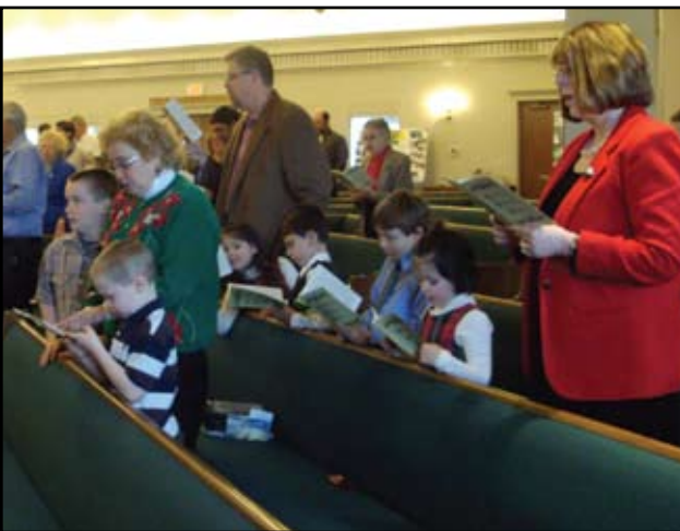
Above: Over 20 children enjoyed the Community Christmas party on Dec. 11.