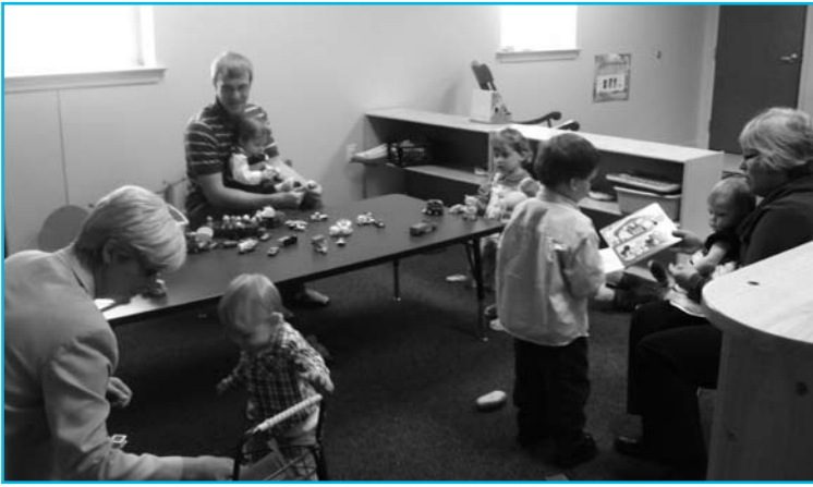
Lots of activity in our church nursery during Sunday morning's worship.