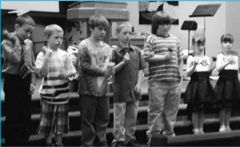
The children's bell choir did a super job on Easter Sunday morning!