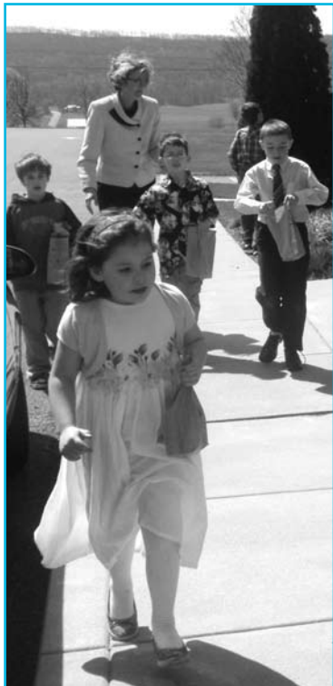
Easter egg hunt during Children's Worship.