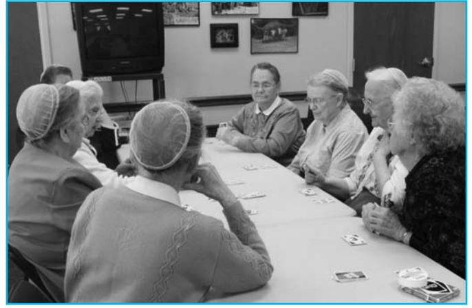
Playing games during Senior Connections!