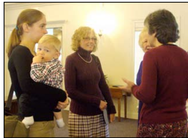
Life at Conestoga in February