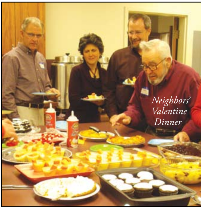
Neighbors' Valentine Dinner