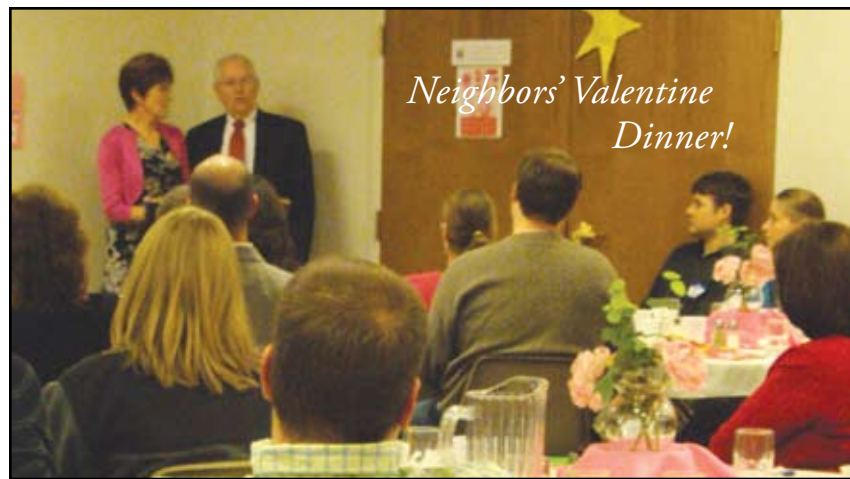
Neighbors' Valentine Dinner!