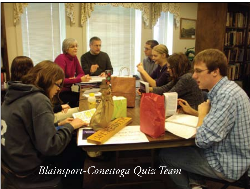
Blainsport-Conestoga Quiz Team