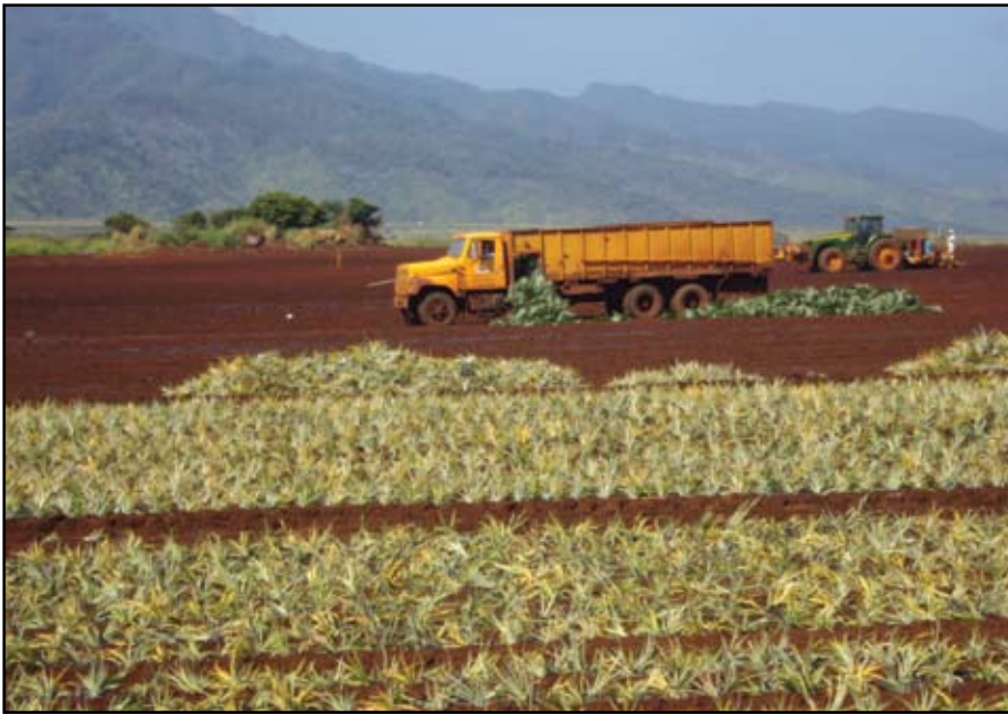
Planting pineapple plants on the Dole Pineapple Plantation in Hawaii.