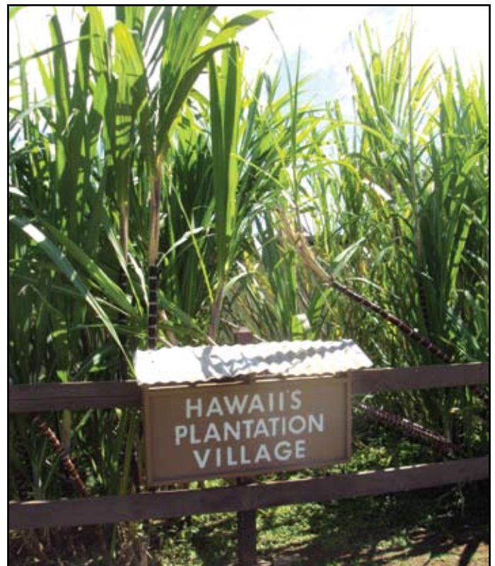
Sugar cane growing at Hawaii’s Plantation Village.

as hard as anticipated—there were very few barriers along the coast that would have kept the huge forceful waves from rushing inland! - Lemar and Lois Ann Mast