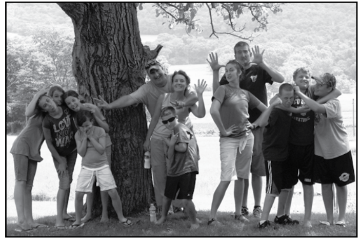
Photos at the June 25-27 Jr. Youth Retreat.