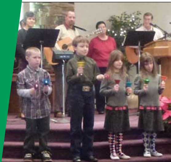
Children's Bell Choir on Christmas morning!

The Christmas Eve candlelight service was a special blessing with Scripture reading, special music, and beautiful autoharp music!